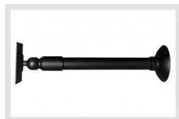
VMC-LCD/WCMB-1 | SKU: 90394