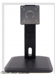
VM-TSHM | SKU: 228560