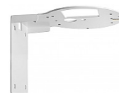
Wall Mount A-SWD5WB3 Item #2787V308

1-800-OK-CANON | NETWORKCAMERAS.USA.CANON.COM