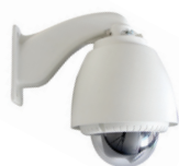
Outdoor Wall Mount A-ODW5CS Item #1381V096